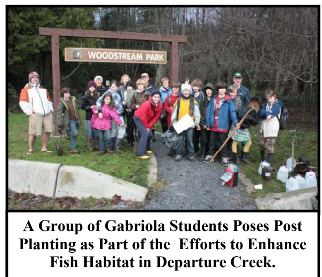
A Group of Gabriola Students Poses Post Planting as Part of the Efforts to Enhance Fish Habitat in Departure Creek.