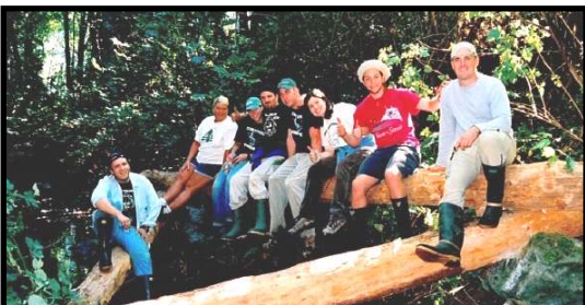
The Project 2000 E-team Poses on a Large Woody Debris Structure They Installed in Departure Creek

APRIL 19, 1995 – NALT becomes a registered Society, is granted the authority to hold conservation covenants registered on a property's title; and shortly after, receives charitable status. First AGM is held in June 1995.