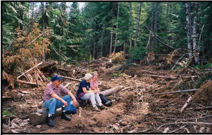
A Group of Hikers Pauses to Survey Recent Logging on Mt. Benson 2005.

Spring 2004 – A Coalition to Save Mount Benson (later changed to the Mount Benson Legacy Group ), comprised of NALT and seven other local groups, is formed to develop strategies for acquisition of the properties; NALT agrees to take on the administrative role.