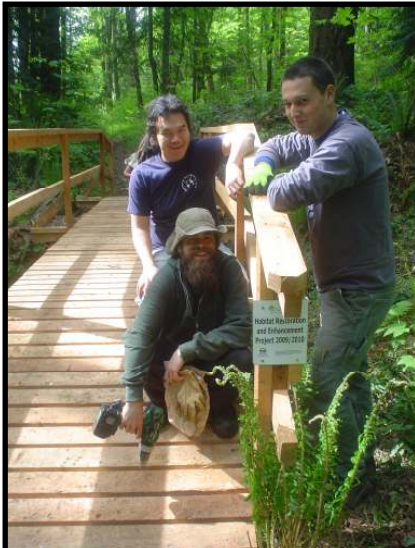
A NALT JCP Crew Builds Bridges at the Parnassian Woods