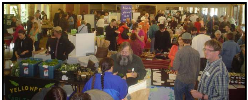
The First Wild Foods Festival Proved Wildly Popular and Has Resulted in an Annual Festival Which is now a Popular Right of Spring in Nanaimo

April 24, 2010 – NALT's 1 st Annual Wild Greens Festival to celebrate and raise awareness of incorporating wild foods into our diet is organized by the Edible Native Plant Project and held at Bowen Park. It is wildly successful, with a crowd of 500 in attendance. That event is now in its 6 th year, and attendance has reached 1,200 to 1,400 annually.