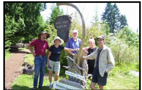
Natural Abundance Native Plant Nursery Volunteers