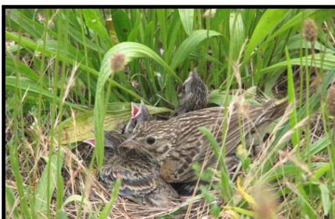
Vesper Sparrow and Nestlings - photo Suzanne Beauchesne.

February 2006 – NALT launches the Mount Benson Acquisition fundraising campaign at a community-wide gathering at Bowen Park Auditorium, which includes live music by local musicians featured on the recently-released CD titled Ode to Mount Benson , a nostalgic sharing of memoirs, anecdotes and archive photos, and an appeal for donations and pledges. This is the start of many events and activities devoted to raising NALT's portion of the purchase price for the properties--$475,000. Some of the more ambitious fundraisers are noted here.