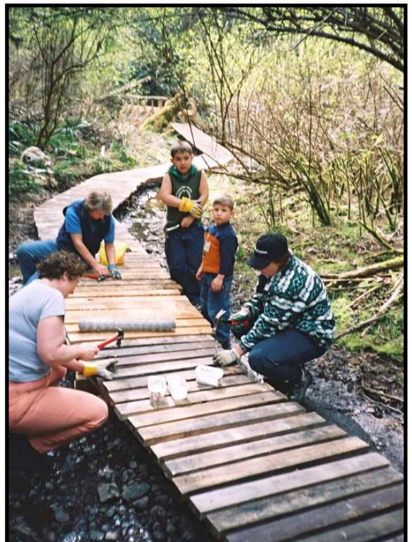
Volunteers of All Ages Pitched in to Build the Linley Valley Boardwalk

2005 – NALT begins a partnership with the Garry Oak Ecosystems Recovery Team (GOERT) to carry out a stewardship project over the next six years that will attempt to protect the last-known small flock of Coastal Vesper Sparrows on the BC coast, which is nesting at the Cassidy Airport. Sadly this project has to be discontinued in 2011, after some years of challenging communications with the airport. The airport expands, and changes its management practices—and the flock disappears.