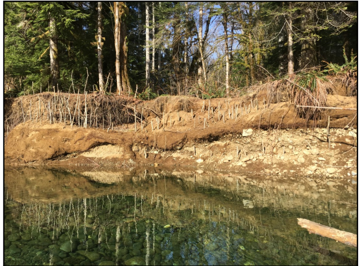
Live staking riparian restoration at Rosewall Creek Provincial Park March 2019.

Soil bioengineering is an applied science that uses live plant materials to perform an engineering function such as slope stabilization, soil erosion control, or seepage control. It involves the use of live and dead woody cuttings and poles or posts collected from native plants to revegetate watershed slopes and stream banks. Wattle fences are short retaining walls built of live cuttings and can be used to treat steep slopes. The terracing reduces erosion while the wood cuttings grow to provide a vegetative cover on the slope. Live staking is taking live cuttings of certain species of plants and staking them in the ground where there is lack of vegetation along eroding stream banks. The clippings will re-sprout and establish new vegetation.