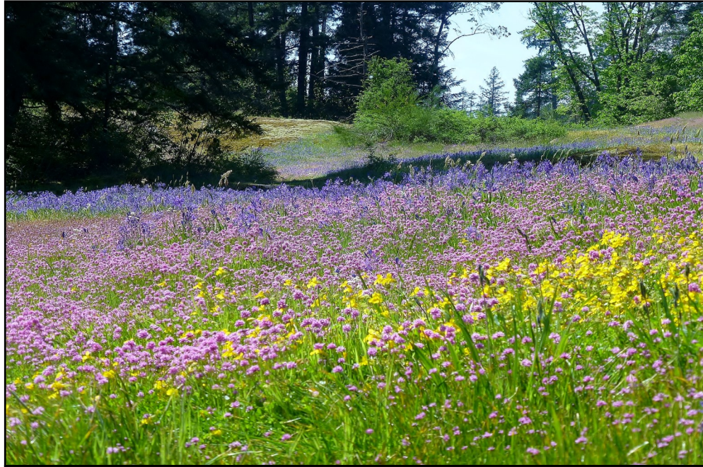
Pink Seablush, Yellow Monkey Flower and Purple Camas display their beauty on a spring day at Harewood Plains.

The plains, located just south of the Nanaimo Parkway in the Chase River area, are a natural meadow where a combination of shallow soils, spring seepage and pooling water provide habitat