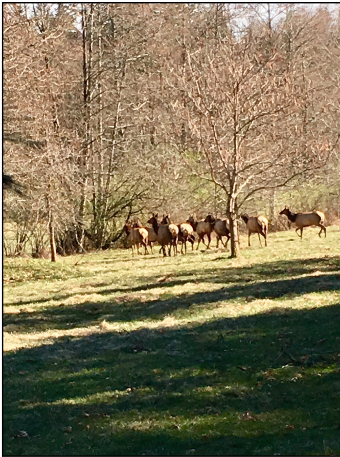
Roosevelt elk touring the nursery to see what's in stock.

It has been a wonderful, sunny winter most days for both the elk and the Native Plant Nursery volunteers. Your dedicated band of nursery workers have even enjoyed some winter picnics basking in the warm winter sun (although we did have a couple of weeks of significant snow as well). What we did not have enough of this winter was rain. That has been the trend for the last few winters at the Nursery and reflects the wider effects of climate change. It impacts the viability