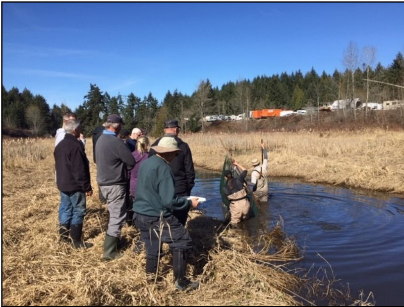
Streamkeepers set the seine in Wexford Creek this Spring.

NALT fundraises throughout the year to host these workshops free of charge to participants. It's a fun, in-stream look at the flora and fauna living in our waterways and provides the foundational know-how to help them thrive.