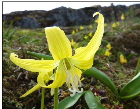
Glacier lilies on the Benson summit; this month in the NALT Calendar.