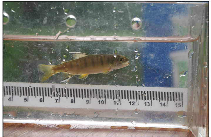
A young Coho Smolt, found happily swimming in Departure Creek.

We seek to achieve our goals with these programs, as the number of streamkeeper groups grow within our community. One day we hope that each stream will have guardians, as we work to build a network of stream stewards in the Nanaimo area.