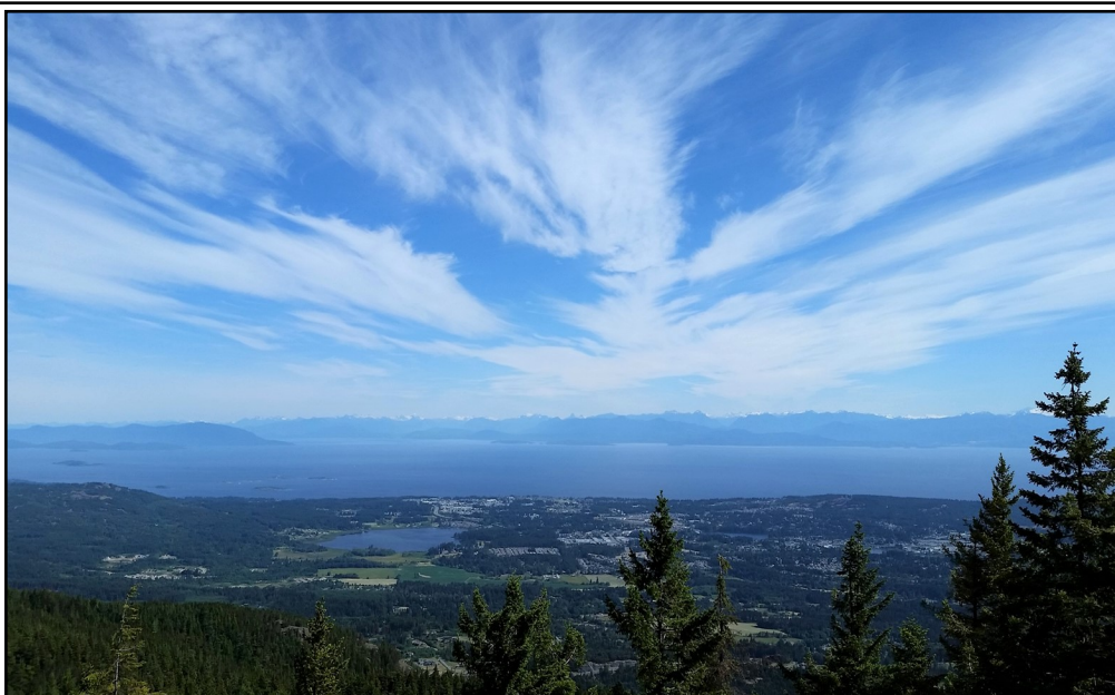
Clouds above the Salish view. A July summer scene in the 2019 NALT calendar.