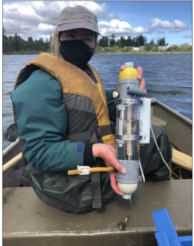
Water monitoring on Diver Lake