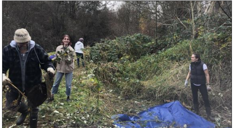
Volunteers remove invasives and plant native plants along the Cat Stream