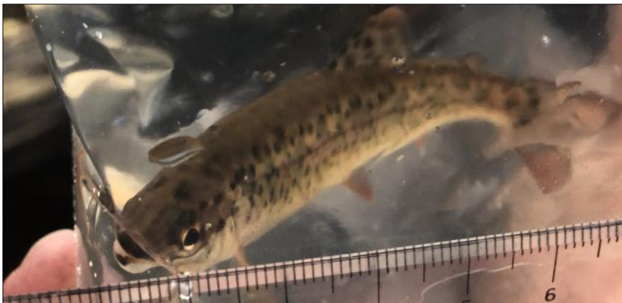
Walley Creek Cutthroat Trout

In September I took on the role of regional coordinator for the Mid-Island region of the BC Community Bat program. This program aims to engage with and educate people about bats as well as to assist with citizen science efforts to collect data so that more is known about bat populations in the area. In October NALT hosted a Bat presentation in Nanoose which was attended by many interested and engaged local residents. We hope to host two more events – one in Oceanside and another in Nanaimo – as our first step in engaging with and educating community members about local bat populations and ways to be involved in bat conservation efforts. If you are interested in getting involved in bat conservation, or if you know of areas where you have seen bats, please connect with me at stewardship@nalt.bc.ca