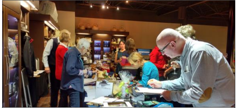
Folks place bids on an excellent array of goods and services at the silent auction tables.

The 4 th annual Wine & Cheese Soiree happened on the evening of Friday, November 18 th on the mezzanine floor of Lucky's Liquor Store, and was a terrific success again this year. People socialized, enjoyed the jazz stylings of the Wellington School Jazz Trio, and bid on a generous array of quality items donated for the silent auction. In addition, there were free door prizes and a raffle for two gift baskets. The snacks and drinks served by the staff of Lucky's were excellent once again.