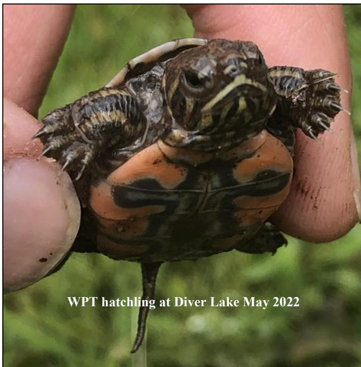
WPT hatchling at Diver Lake May 2022

Western Painted turtles often occupy the same habitat as a non-native species, the Red-eared Slider. Red-eared sliders compete with Western Painted turtles for resources such as basking locations, nesting spots and food. They also have the potential to hybridize with our native species (as has occurred at a few sites on the mainland) and to spread diseases such as respiratory infections. The easiest way to distinguish a Western Painted Turtle from a Red-eared slider is to look at the plastron (the lower shell); if the plastron is a bright reddish-orange then it is a Western Painted, if it is yellow then it is a Slider. Not all Sliders have a clearly visible red ear. If you have an observation to share, it is most helpful to submit a photo to help us verify species.