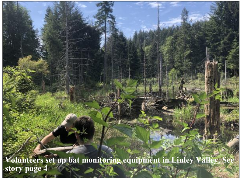
Volunteers set up bat monitoring equipment in Linley Valley. See story page 4