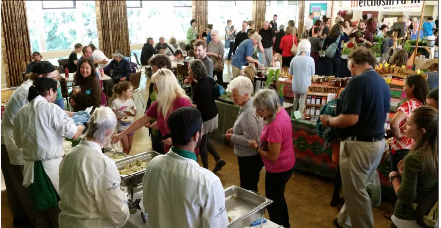
Folks lined up to sample the delectable treats like those offered by the VIU Culinary students

With lowered expectations and not a little trepidation, we began planning for this year's event. Another warm early spring heightened our worries, but soon cooler weather calmed our nerves. As chefs and vendors came onboard, enthusiasm began to build. On the day of the festival, the rain that was predicted held off, the hoped-for crowds arrived, and we knew we had a recipe for success.