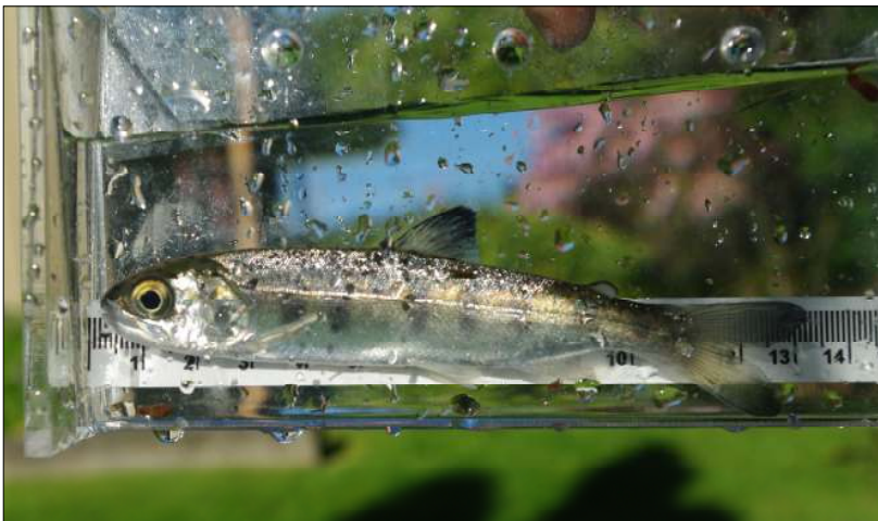
A coho smolt is measured and recorded by volunteers on Departure Creek.

Trained Streamkeepers, members of the Island Waters Fly Fishers, local residents and other community volunteers monitored the trap on a daily basis, early each morning. The volunteers were divided into seven teams, each team assigned to a specific day of the week. The team identified and recorded measurements of Coho smolts captured in the trap, before releasing them to continue their journey to the sea. Other aquatic species caught in the trap were also recorded and released. At the same time, with the aid of instruments, each team collected important water quality information—such as water levels and temperature, dissolved oxygen levels, turbidity and pH levels, as well as air temperature and weather conditions. Students from the Departure Bay Eco School, accompanied by their teachers, also participated in the monitoring activities.