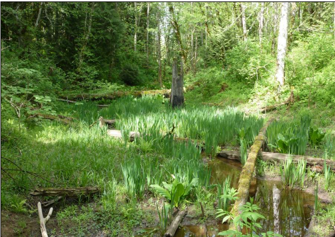
A wetland wakes up after the dormancy of winter.