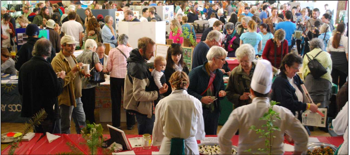
Folks enjoy the tasty food samples and the wares of local vendors at the Wild Foods Festival. Definitely the place to be on April 23 rd .

NALT's Wild Foods Festival is back after a one-year hiatus. This is the definitive spring event for Nanaimo that you won't want to miss. This year, the Festival is scheduled for Saturday, April 23 rd —again in partnership with the City of Nanaimo's Earth Day celebrations. This "wild" event celebrates the natural bounty of the Earth in spring, and the creative talents of our region's earth-friendly community.