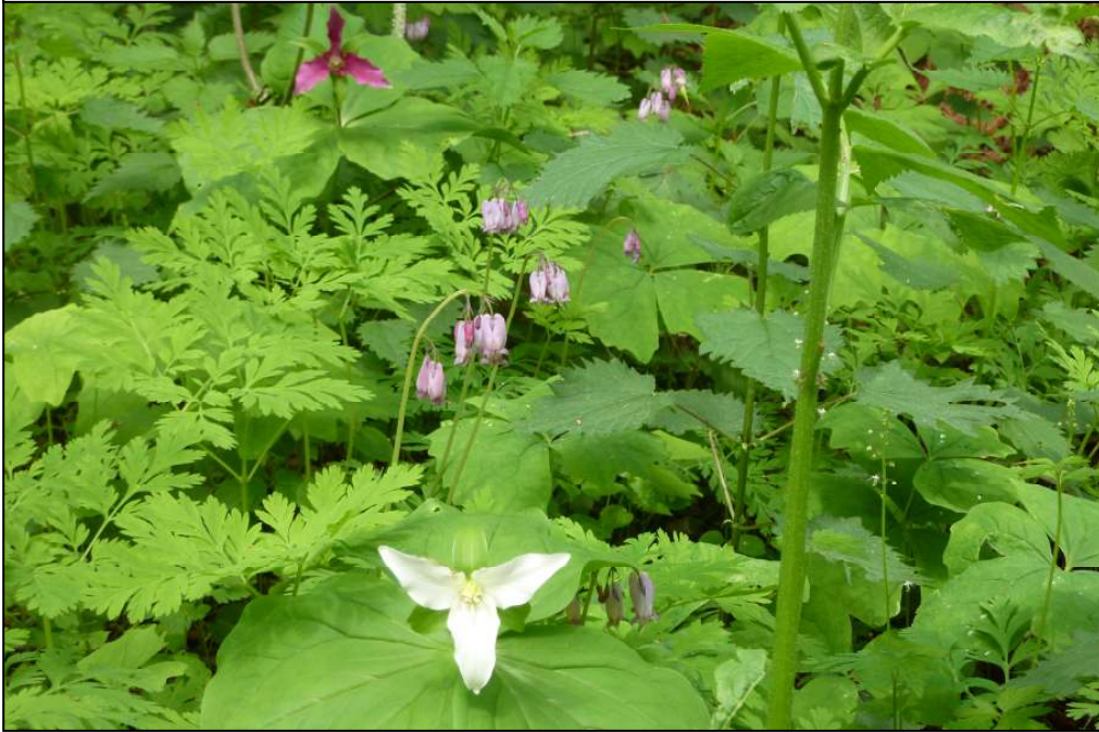
Trilliums and bleeding hearts. Spring in the Parnassian Woods.