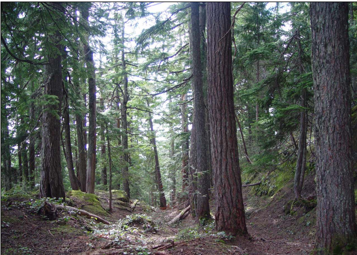
Older Forest along the Te'tuxw'tun Trail in Mount Benson Regional Park.