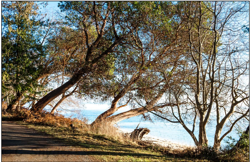
This image of sunlight shining on arbutus trees that line a Yellow Point pathway is featured as the month of March in the NALT 2016 Calendar.