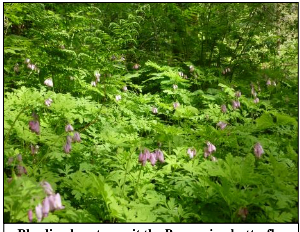
Bleeding hearts await the Parnassian butterfly.

You will find the Natural Abundance Native Plants Nursery table at Seedy Sunday at NDSS on March 3rd, then again at the Earth, Water & Wild Foods Festival organized by a partnership between NALT, City of Nanaimo and the RDN—on April 23<sup>rd</sup> at Bowen Park. We'll have seeds, a good sampling of potted native plants, information, and lots of volunteer enthusiasm.