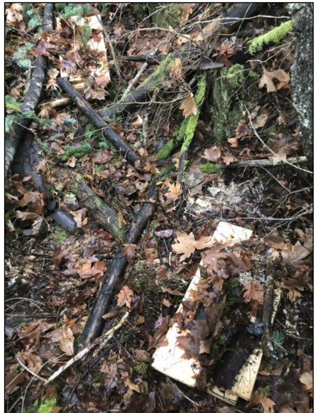
Cover board in wooded area

Salamander cover boards are an easy and minimally disruptive way to monitor salamander populations