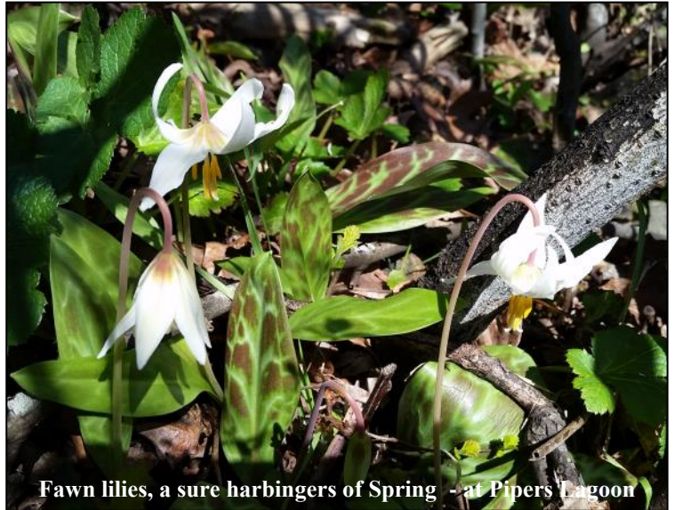
Fawn lilies, a sure harbingers of Spring - at Pipers Lagoon