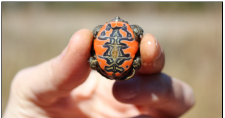
A Western Painted Turtle hatchling.

In 2021 we launched our volunteer-based basking survey program, where volunteers went out to possible turtle habitat sites during basking season and checked for presence of Western Painted Turtles. We went to locations where the public had submitted observations to the province, but those observations were not confirmed by qualified professionals, usually due to a lack of photographic evidence, or the quality of submitted photos not allowing a confirmation of species. This work has resulted in the confirmation of WPT at Sywash marsh in Lantzville, as well as the confirmation of nesting happening at that site.