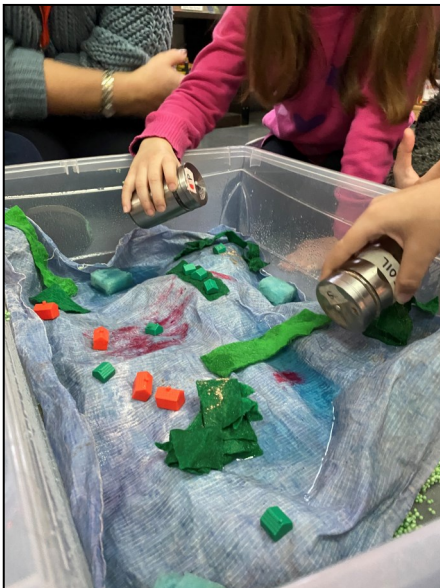
Making watersheds models in the classroom and seeing how natural systems and human activity influence each other.

The School Water Stewards Program has been busy visiting our 13 participant classes this winter session. During these past few colder months, we have been keeping warm indoors, learning about watersheds and designing our own mini watershed models. As the weather is becoming more pleasant, we have been venturing outside with classes to visit each school's local water feature including Walley Creek, Northfield Marsh, Chase River, Millstone River, and the Parksville Wetlands. We have been teaching lessons about stream health assessments and water quality/natural filtration to encourage a sense of stewardship towards these natural areas. We have also begun exploring what we can find in these freshwater ecosystems by looking at aquatic macroinvertebrates through digital microscopes. A few of our classes are now gearing up to participate in stewardship projects this month, including salamander monitoring, native plant propagation, birds counts, and plant phenology monitoring.