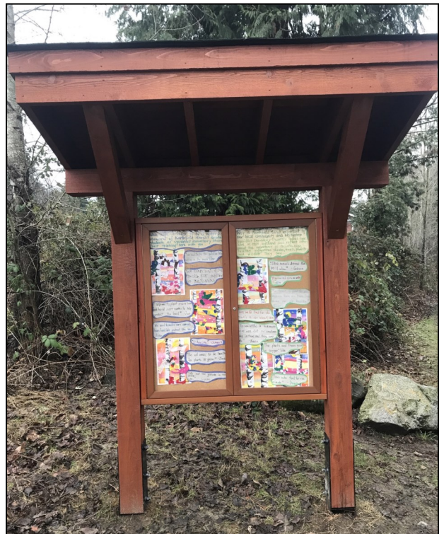
sywéñct School Water Stewards share their artworks and thoughts in the new kiosk at Northfield Marsh Park