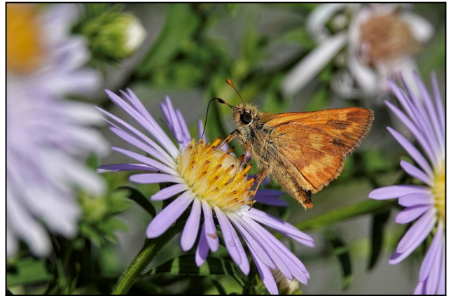
Woodland skipper on Douglas' aster. Photo: Lynda Stevens from NALT's new pollinator note card series.

Over 50 varieties of local native seeds are ready for sale. They will be available to purchase at the nursery as soon as the risk of damage by damp, cold weather is past. We'll post on the website when seeds are again available for browsing and buying at the nursery. If you need your seeds sooner, just email plants@nalt.bc.ca . Varieties are listed on the NALT website inventory, and you can currently pick up your seeds at the NALT office, the Nursery, or by mail order. All seeds are $4/ packet. With the trails cleared, damaged trees removed, and the bridges