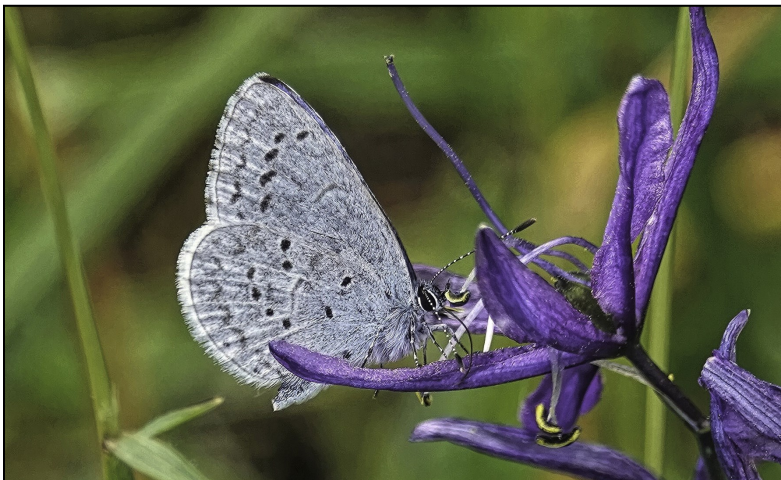
Echo Azure on camas species. Photo: Lynda Stevens from NALT's new pollinator note card series.