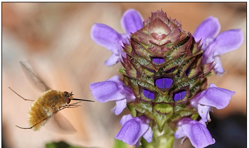
Fuzzy wuzzy was a fly! A woolly bee fly at self heal. Photo: Lynda Stevens from NALT's new pollinator note card series.

Thanks to the generous donation of wonderful pollinator photographs provided by Lynda Stevens, NALT is offering a series of note cards for purchase of native pollinators buzzily doing their thing. We have bee flies, bristle flies, calligrapher flies, miniscule carpenter bees, sweat bees, long-horned bees, bumble bees as well as the more elegant Echo Azure, Purplish Copper and Woodland Skipper butterflies and an adorable Anna's hummingbird. Cards are $3.00 each or 4 for $10.00. Proceeds will support pollinator stewardship projects.