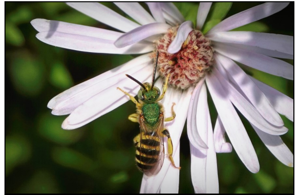
Striped sweat bee on Douglas' aster.