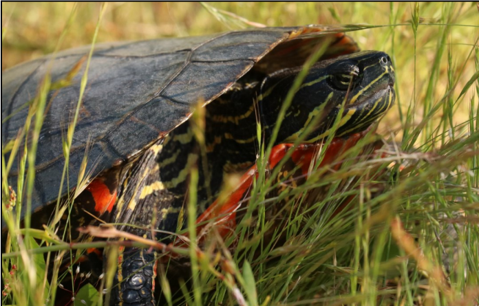
Western Painted Turtle at Buttertubs Marsh.

NALT is excited to share a new Western Painted Turtle project that we are launching this year with our partners in the City of Nanaimo's Parks, Recreation and Culture department, the provincial ministry of Water, Land and Resource Stewardship and Nature Trust. Our Western Painted Turtle Ambassador program will get community members involved in stewardship of this threatened species, while at the same time helping us to collect valuable data on turtle population dynamics and nesting at Buttertubs Marsh.