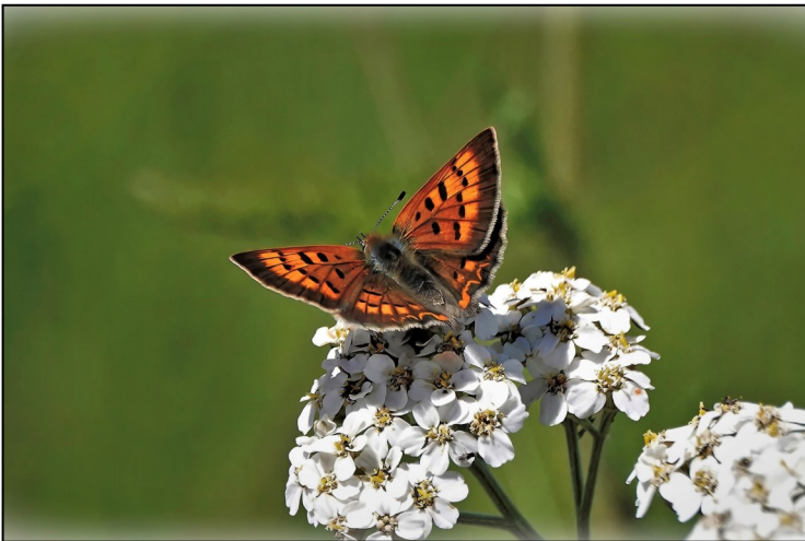
Purplish copper on yarrow.

renewed, we are glad to again offer interpretive nature walks on the Parnassian Woods property. The first groups "booked" their interpretive walks for April 26 and 29. If your group is interested, email us at plants@nalt.bc.ca . A visit to the nursery is included.