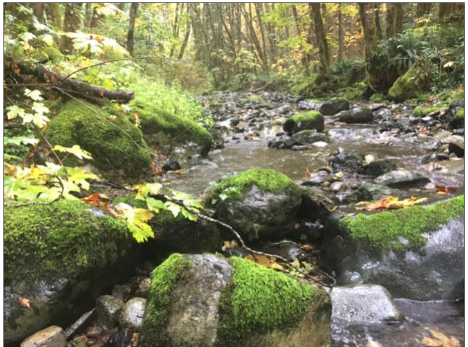
Siddoo Park along the Koksilah River - a new regional park in the Cowichan Valley protected by a conservation covenant, co-held by NALT in partnership with the Cowichan Community Land Trust.

On the morning of actual Rivers Day, more folks took part in a number of half-day tours, including a trip to the Morden Colliery Park, guided walk at the estuary and a rafting tour of the lower reaches of the river and the estuary. Following these tours, people were encouraged to join the City and NALT at the lower picnic shelter in Bowen Park—to enjoy live local music, a guided walk of the Millstone River, other educational activities about the importance of rivers to our community, and NALT's signature BBQ salmon burgers. Cooperative weather, a scenic setting, assorted activities for all ages, and great food all contributed to make a successful, family-oriented Rivers Day in Nanaimo.