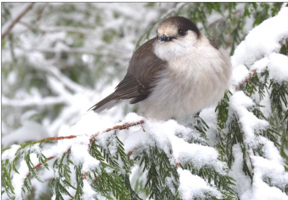
A friendly and curious grey jay (a.k.a whisky jack) on Mount Benson - a glimpse into the 2019 NALT calendar.