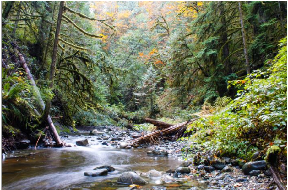
An autumn scene at Benson Creek Falls Regional Park