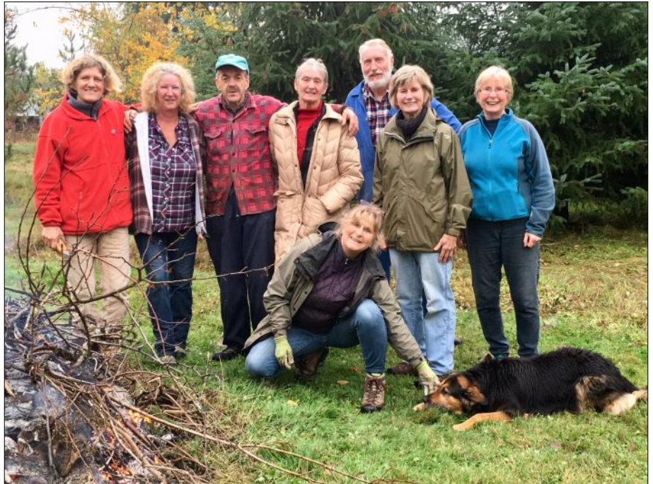
A group of smiles from the NALT nursery volunteers.

Another sign of the season is stepped up propagation as we plan for the 2019 season. Along with that comes winterizing to protect plants from heavy rain, wind, and cold. Also, our water lines and the rainwater collection tanks need to be drained for winter. Soon we'll lower the plastic side of the greenhouse, a sure sign that winter weather is here.