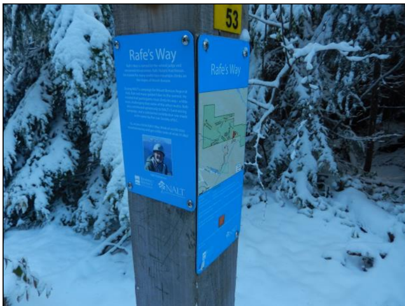
An early November snow at the Rafe's Way trailhead