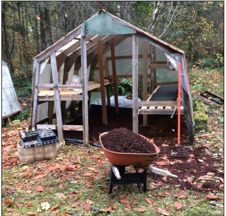
The propagation hut.

The nursery will be closed to shoppers after December 20 th , and will reopen January 10 th . A New Years celebration will include our traditional stone soup – visitors always welcome!