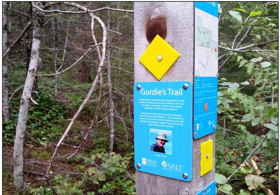
Gordie's Trail trailhead on Mount Benson.