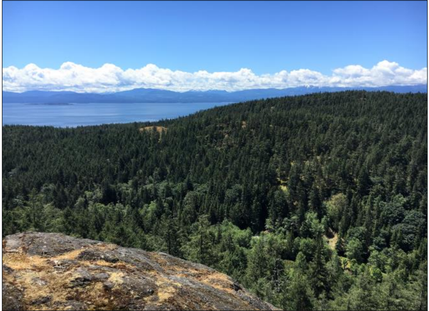
A view atop a Salish View ridge.

Gordon Scott Lasqueti Island Nature Conservancy LINC 11 Main Road Lasqueti Island, BC V0R 2J0 (250) 333-8754