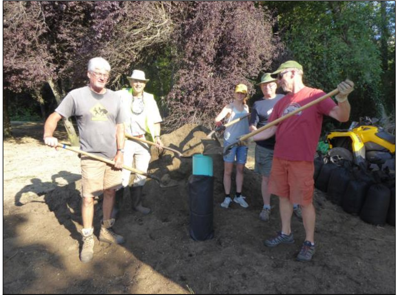
Departure Creek volunteers hard at work

Thank you to the Pacific Salmon Foundation; to the Snuneymuxw First Nation; the City of Nanaimo; the Regional District of Nanaimo; the Pacific Streamkeepers Federation; the Milner Group for their donation of trees and stumps, riprap and cobble, fill for the 400 bags and all the trucking; to Island Equipment Rentals, Parksville, for the donation of 2 bypass pumps, hoses, drill, dirt pounder and any other piece of equipment needed; to the