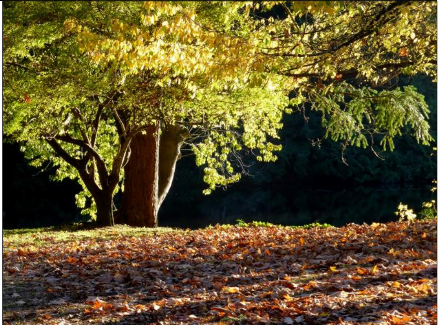
The Golden Hour at the Colliery Dams, as featured this month in the 2018 NALT Calendar