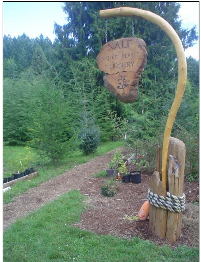
New signage at the Native Plant Nursery

We welcome Jo and are glad she's aboard. Come check out the nursery if you too might be interested in volunteering. Happy fall!