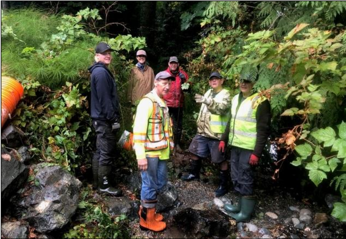
A team of volunteers improve fish habitat on Walley Creek.