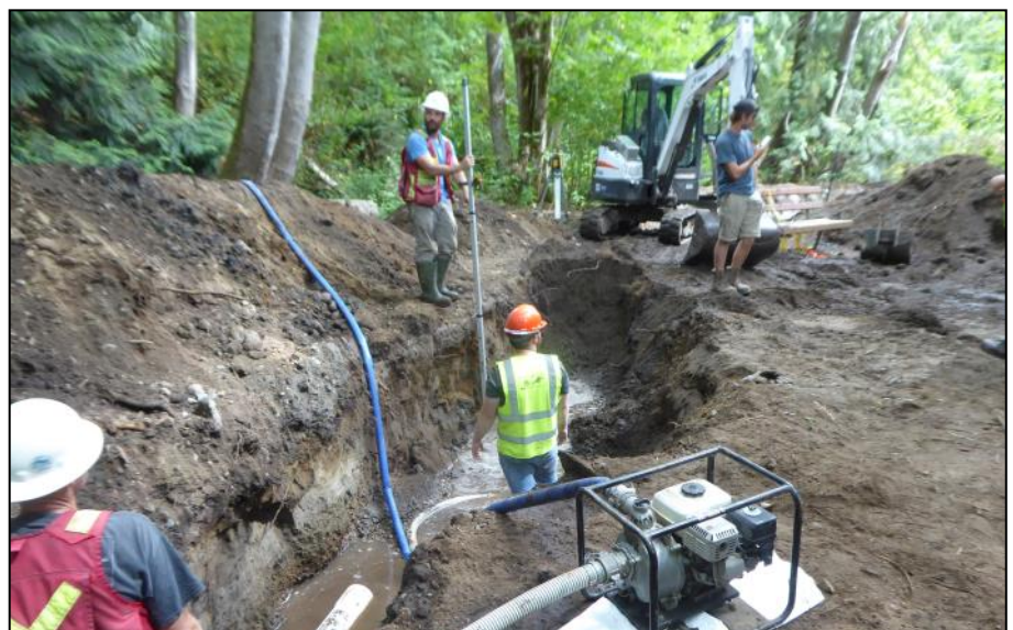
Led by the Departure Creek Streamkeepers, a project team came together to enhance side channel habitat for salmon in Departure Creek.

We would like to express our gratitude for all who support NALT through these fundraising events and those that donate directly to the Regional Recycling Depots year-round at 2375 Hayes Road and 839 Old Victoria Road in Nanaimo. We encourage you to utilize these recycling locations when possible. Simply tell the cashiers to "put it on the NALT account". We thank you for your continued support and look forward to seeing you at the next bottle drive.