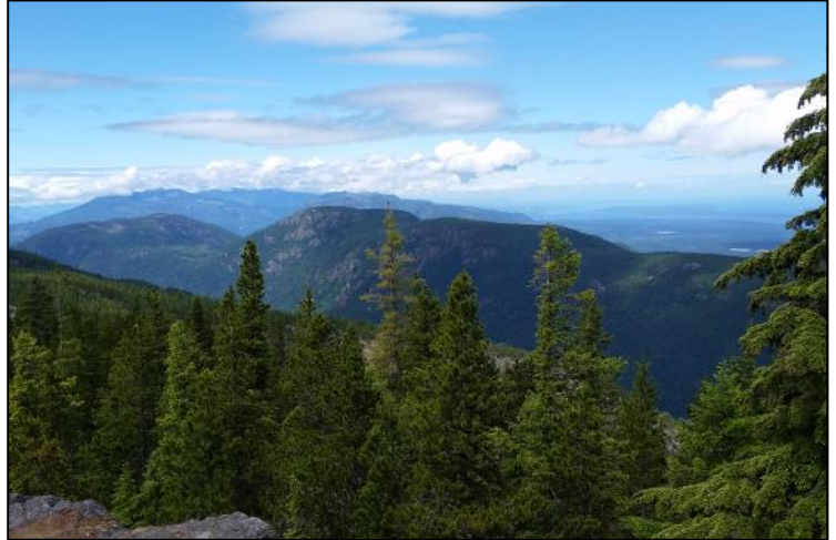
A view of the Wesley Ridge above Cameron Lake.