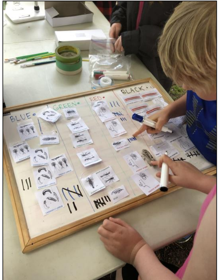
Students learn about aquatic invertebrates (kids learn about bugs in the creek) as part of the School Water Stewards program

We are excited to offer this program, which can be delivered as monthly outings or as clustered seasonal outings (4-6 outings in Fall or Spring), to any interested classes in School District 68 or 69. In addition to providing lessons to enhance understanding about freshwater ecosystem health and function, we will support the class in a capstone stewardship project that will improve or enhance the ecological health of their local stream or wetland. Thanks to our funders we are able to offer this program for free. To get involved, contact NALT at stewardship@nalt.bc.ca