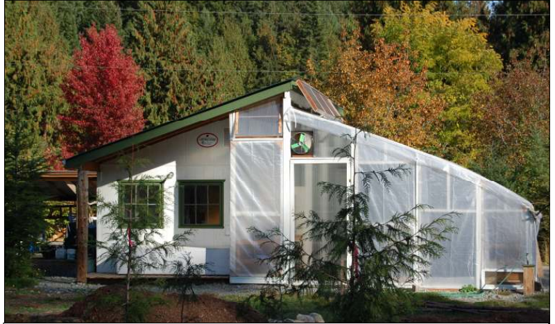
The nursery green house amidst the fall foliage.

As summer moves to fall, we do less watering and no less weeding. We collect seeds and package them for year-round sales. Another late summer task is to sort and wash every pot (a good brushing and 3 rinses) so they are ready to receive new growth. Some call it adult water-play, but it gets the job done. We are now finishing up the annual RDN project, where the nursery provides little plants and seeds for the RDN to distribute at their community events. It's a win-win – native plants and seeds draw the public to the RDN display for education about water-related issues; and the NALT Nursery wins with the exposure of our drought-resistant plants and seeds that carry our contact information.