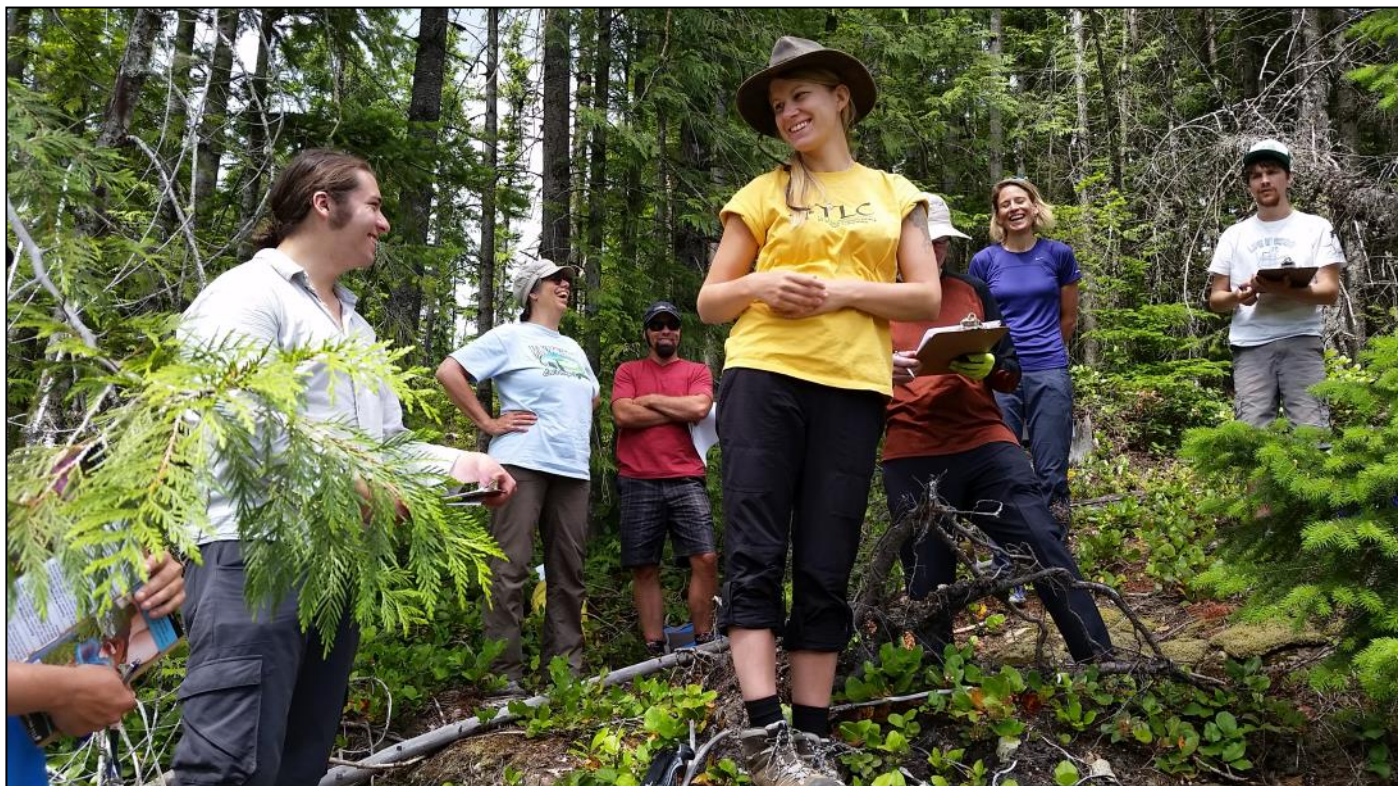
Monitors take a moment to share a laugh while revisiting vegetation plots on Mount Benson