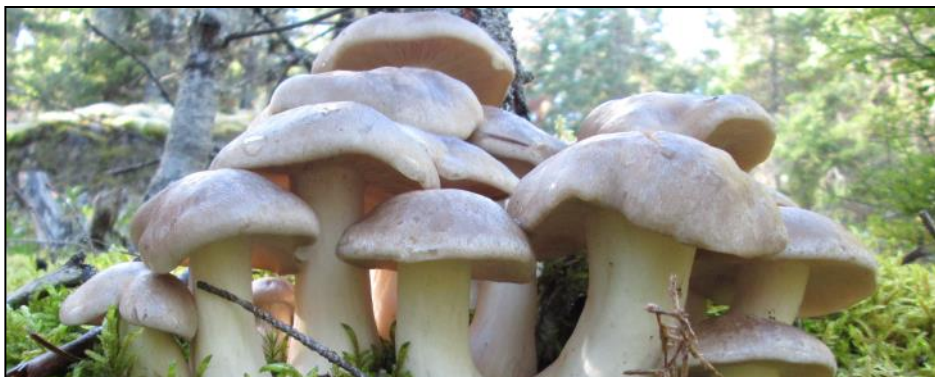
Featured photo for September in the 2017 NALT Calendar.

Last year's calendar was a great success for NALT, and we hope to build on sales and satisfaction with the 2018 Calendar. Stay tuned for an announcement of the beginning of sales, and thank you all for your excellent photo submissions.