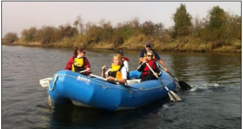
Rafting is just one of the things to enjoy at Nanaimo's Rivers Day Celebration.