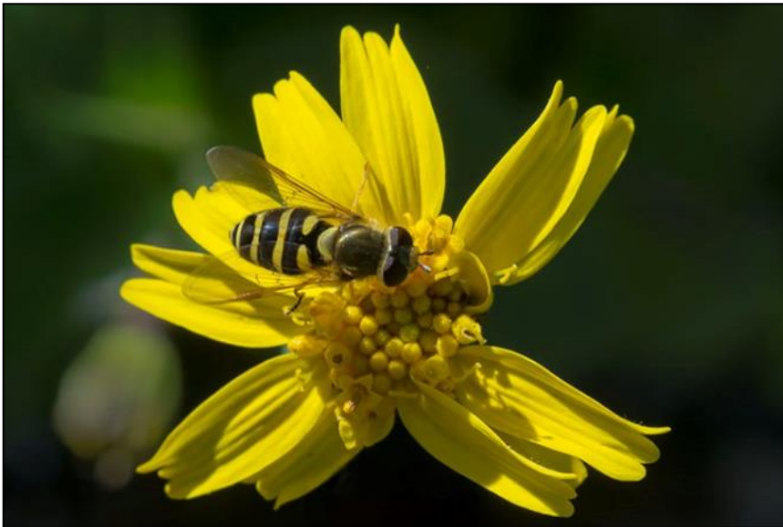
Arnica receives a visitor

RDN has worked with us all summer. Nursery volunteers prepare orders weekly, then the RDN WaterSmart team uses the plants and seeds at various community events in their educational displays. It's a nice win-win for both NALT and the RDN. Drought resistant native plants attract visitors to the RDN displays, and the plants and seeds attract the same visitors to the nursery for more. We appreciate the cooperative effort between the WaterSmart team and the NALT nursery team!