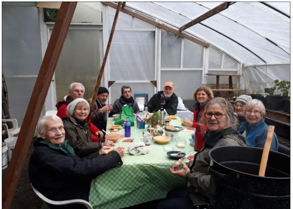
Volunteers gather around the table to share stone soup at the Nursery.

Thanks for your support, which we appreciate from our plant-loving hearts.