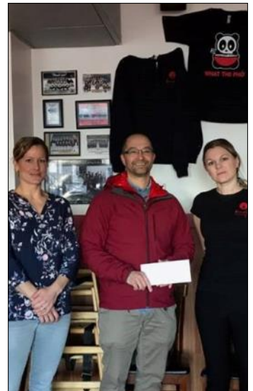
NALT received a $1,200 donation from the Huong Lan Restaurant.

Our next bottle drive will be on April 7 th , 9:00 am until 2:30 pm in the parking lot beside Lucky's Liquor Store at the Country Club Centre. We hope to see you there! (See poster on back page).