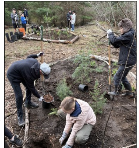
Students from Ecole Hammond Bay work to restore Walley Creek.

NALT is always keen to support community members who want to create or enhance habitat in their neighbourhood. We are able to provide project planning support, advise and support with funding and grant opportunities, the use of our tools and most importantly, the help of our over 400 volunteers to turn a tough job into an easier (and more fun) one. This spring we have connected with neighbours living along Victoria Rd who want to turn their turf covered bump-outs into habitat. Having joined together in their passion for gardening, pollinators, and learning about local ecosystems, they received a Nanaimo Foundation Neighbourhood Small Grant and approached us for advice on how to make their project a success. With a bit of guidance on project timing and which native plants on their list would do best at the site, as well as the use of our tools and a NALT volunteer call out, the project was launched this March. The first phase of removing the thatch had an abundance of community volunteers and resulted in further expanding neighbourhood and community support for the project. It was a great opportunity for other like-minded community stewards to think about the possibilities in their own neighbourhoods where bare or neglected patches can be transformed into thriving habitat for pollinators and other wildlife. The next step of the project will be planting, which is slated for Saturday, April 19 – Volunteers are welcome!