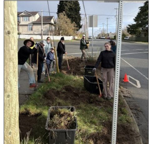
Finishing what the crows started. Before and after of a bumpout ready for planting native pollinator habitat.

"Lowly, unpurposeful and random as they may appear, sidewalk contacts are the small changes from which a city's wealth of public life may grow." - Jane Jacobs, "The Death and Life of Great American Cities"