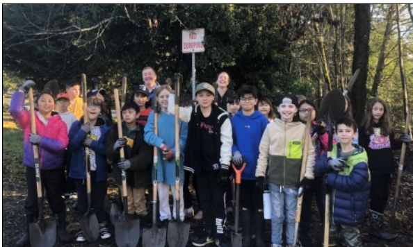
Rock City Elementary Students restore Joseph Creek, a tributary of Departure Creek.

Working together with the Victoria Rd neighbourhood stewards NALT is creating a 'how-to' tool kit that make launching similar projects in neighbourhoods throughout the mid-island a less daunting task. Reach out to us, if you are interested in starting a project to create habitat patches on boulevards, bump-outs or neglected patches of grass that can suitably be transformed to support wildlife and natural ecosystem processes.