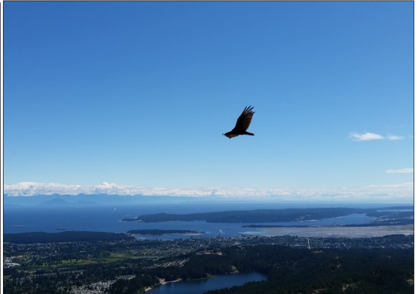
The first Turkey Vulture of Spring .