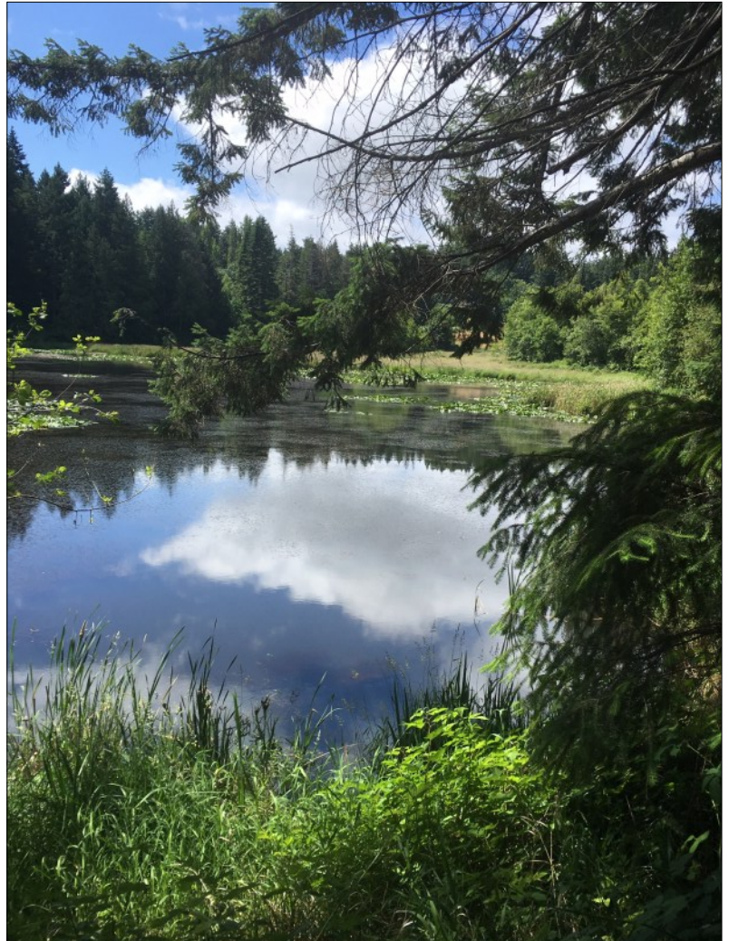
Cottle Lake in Linley Valley.

These and other initiatives should firmly establish Cottle Creek as a demonstration watershed in a rapidly growing city that espouses environmental sustainability in its Official Community Plan ( City Plan - Nanaimo Reimagined ; July 4, 2022).