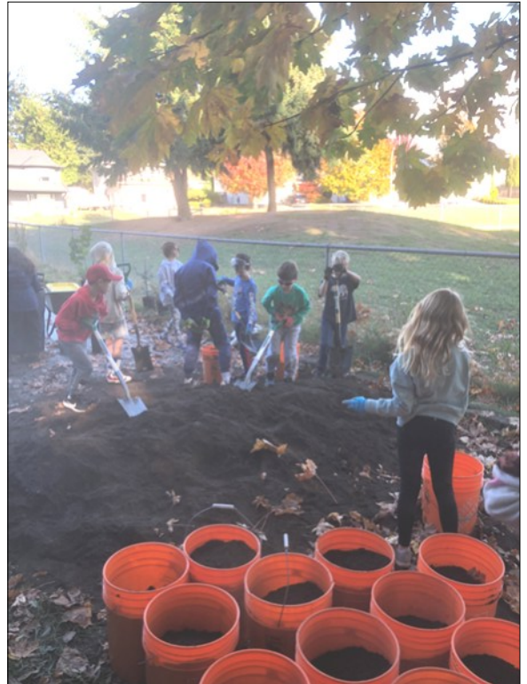
Students from syuwéñct School dig in to restore riparian habitat at Northfield Marsh.