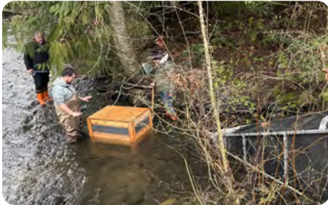
Cat Stream smolt trap installation.

Spring is a busy time for Stewardship! This year we have our Turtle Ambassador program starting up again in May, as well as continuing our Bat program with the BC Community Bat Program. We also have two new projects launching: our Cat Stream Smolt Trap project and our Vernal Pools Mapping project.