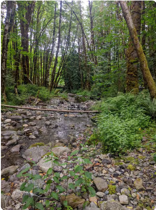
Four Mile Creek