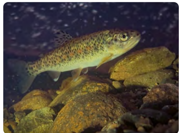
Fig 2. Coastal Cutthroat trout, headwater stream ecotype found in Cottle Creek.