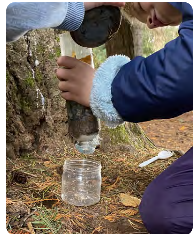
What do we have here?