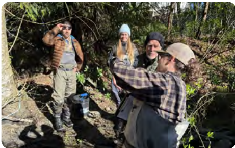
Smolt trap volunteer training